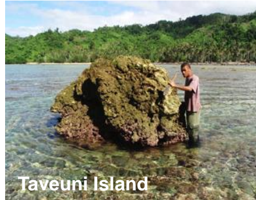
CYCLONE THOMAS, 2010